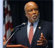
US Representative (MS-D2) Chairman Bennie G. Thompson