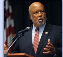
US Representative (MS-D2) Chairman Bennie G. Thompson