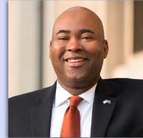
Democratic Party Chair Jaime Harrison