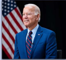
United States President Joe Biden