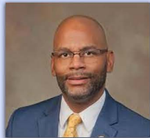
Public Service Commissioner De'Keither Stamps