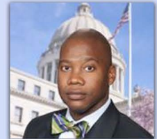
Senate Minority Leader Senator Derrick Simmons