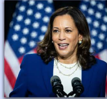
United States Vice President Kamala Harris